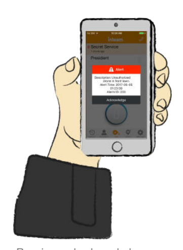
Receive and acknowledge alarm or incident alerts mobile device

San Jose, California - June 12, 2017: Deltapath® inTeam™ is the ultimate solution for transforming the way your organization communicates. Inspired to integrate conventional communication workflows with technology, Deltapath, Inc. announces the release of Deltapath inTeam, an all-in-one mobile app for organizations to enjoy push-to-talk (PTT) over Wi-Fi and 3G/ LTE cellular data.